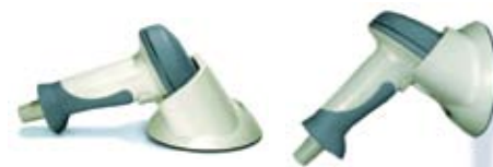
1100/1105 & 1200 Holder