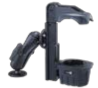
Vehicle Cradle DC 12~48V input

Charging and Communication Cradle USB client / USB host / Ethernet