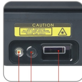
Camera LED flash Barcode scanner