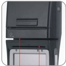
MSR IC card

With such a complete feature set, MF-2350 is simply the best handheld for your business environment.