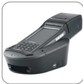
Cradle with USB, RS-232, and spare battery charging slot