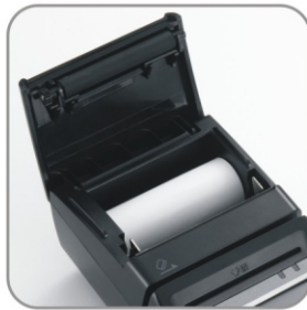
2" Thermal printer with easy drop-in paper