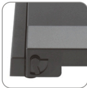
Quick release latch design for easy maintenance