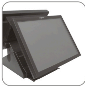
Support Dual Display 15" or 11.6"