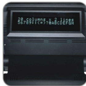
2 x 20 VFD Rear Display