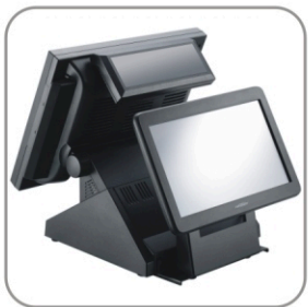
Support Pole mount Dual