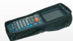
• Functional Case