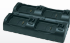
• Multiple Battery Charger