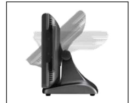
0° to 90° Tilt