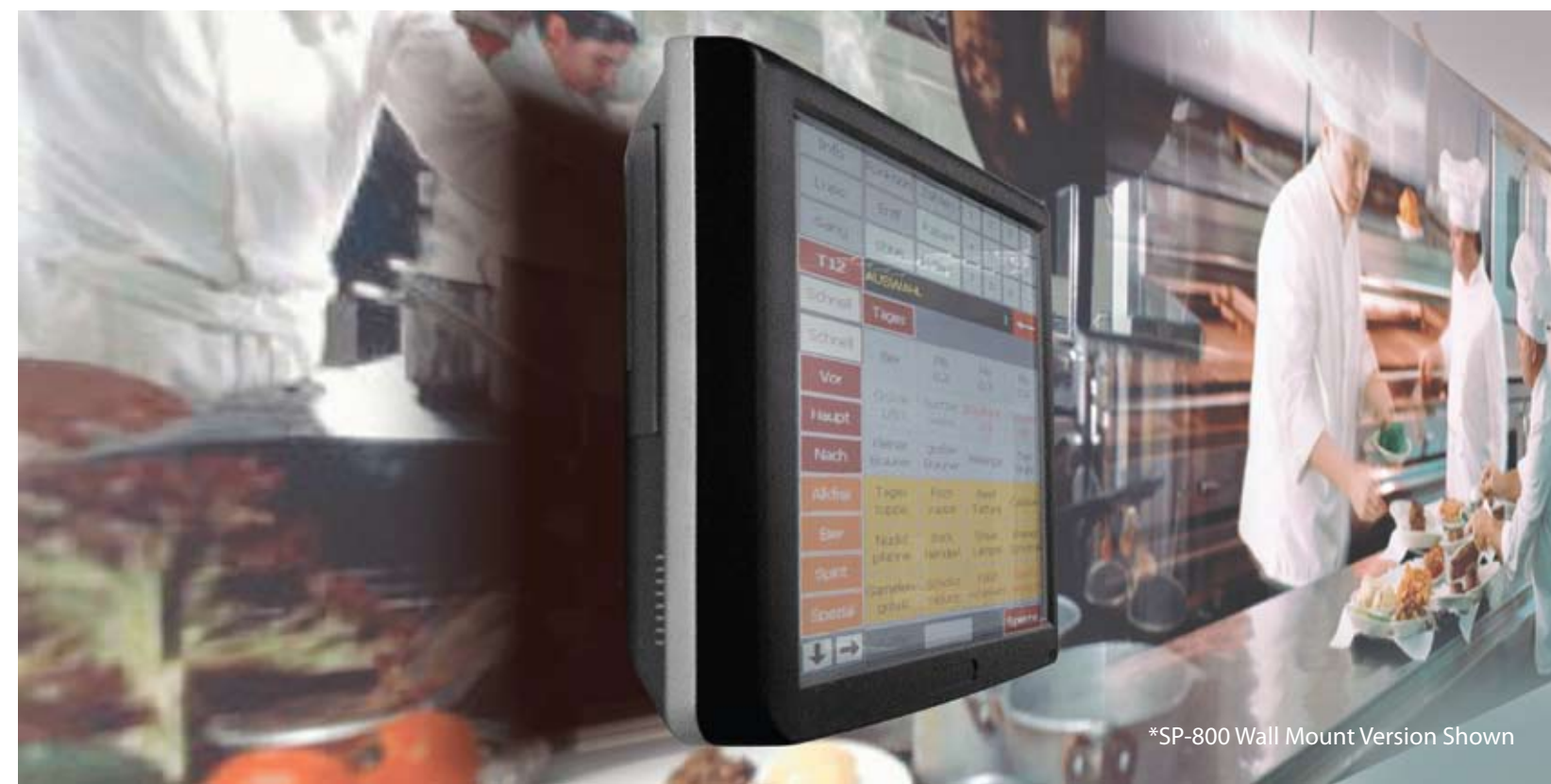
*SP-800 Wall Mount Version Shown