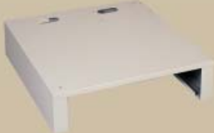
Enclosure accommodates large peripherals