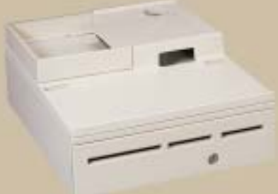
Platform with printer frame kit

With over 250cu.in. of media capacity and deep storage compartments, the MediaPLUS holds more receipts, documents and other media than any other drawer of its size. A choice of 4 popular sizes, universal printer interface and adjustable storage compartments makes this the most versatile cash drawer available anywhere. Add a rugged polyurethane platform or steel Enclosure to secure POS peripherals and store cables and power strips, and the MediaPLUS becomes the perfect base to build a system upon.