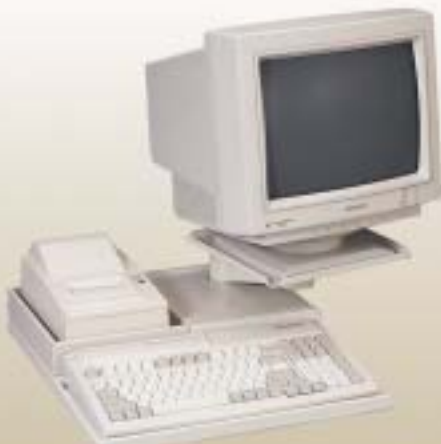
Peripheral Platform with Lazy Susan monitor stand