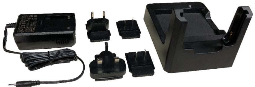
ALX-540 International PSU & Dock (included in base SKU)