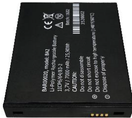
ALX-542 (one included in base SKU)