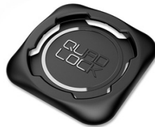
ALX-541 Quad Lock® smart device connector