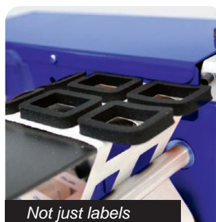
Not just labels