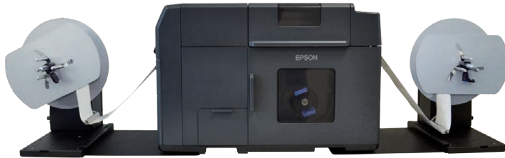
LABEL REWINDER (ASD1111-S0) - Epson C7500 printer - LABEL UNWINDER (ASS1111-S0) (Not included)

The Unwinding/Rewinding system for Epson C7500 Label Printer can handle media up to 5" (127mm) wide and unwind/rewind label rolls having outside diameter up to 10" (250mm).