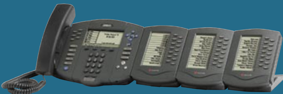
IP 601 Attendant Console Add expansion modules as your business grows