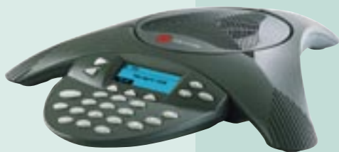
IP 4000 Conference room speakerphone