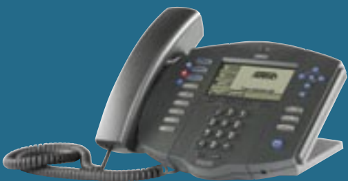
IP 501 3-line telephone

The ADTRAN NetVanta 7100 Office in a Box offers a significantly lower initial cost and ongoing maintenance expense as compared to traditional systems. Cost savings are achieved by consolidating voice and data networks, reducing monthly service charges, and eliminating expensive add-on phone and voicemail licenses.