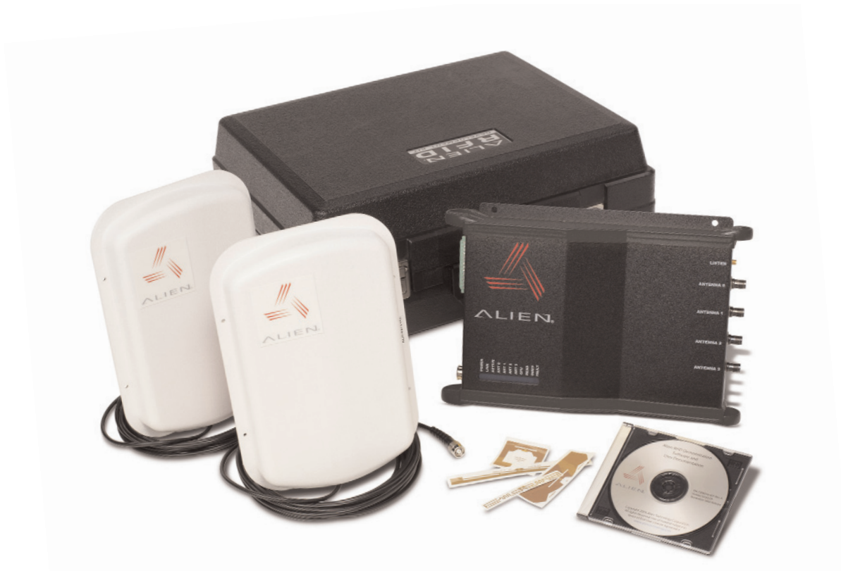
Figure 2: A complete developer's kit for Java and .Net environments is available.