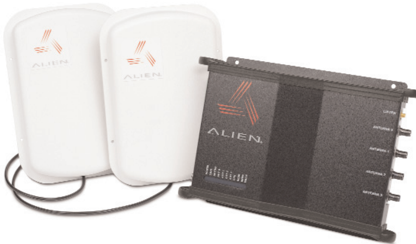
Figure 1: The ALR-9800 is available with linear or circular antennas.

Upon restoration of power after a power loss, the ALR-9800 resumes its previous configuration and operational mode. A tag list of up to 2500 tags is stored in non-volatile memory.