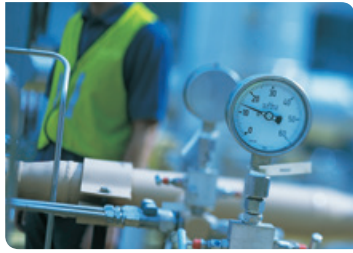
Field Force Automation