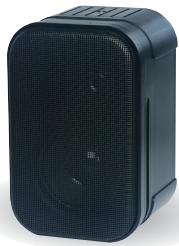
FG15B (Black) FG15W (White)*