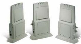
Figure 1. Cisco Aironet 1000 Series Lightweight Access Points

Cisco® Aironet 1000 Series lightweight access points are specifically designed for operation with Cisco Wireless LAN Controllers and the Wireless Control System management tool. They provide dual band support for both 802.11a, 802.11b and 802.11g, simultaneous air monitoring for dynamic, real time RF management. In addition, Cisco Aironet 1000 Series Lightweight Access Points handle time-sensitive functions, such as Layer 2 encryption, that enable Cisco wireless LANs to securely support voice, video, and data applications (Figure 2).