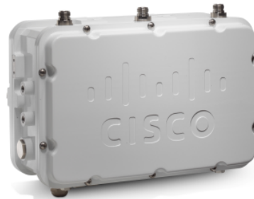
Figure 1. Cisco Aironet 1522

The Cisco Aironet 1522 supports dual-band radios compliant with IEEE 802.11a and 802.11b/g standards. Various uplink connectivity options are supported such as Gigabit Ethernet (1000BaseT), and small form-factor pluggable (SFP) for fiber (100BaseBX) or cable modem interface. Power options supported includes 480VAC, 12VDC, cable power, Power over Ethernet (POE), and internal battery backup. It also employs Cisco's Adaptive Wireless Path Protocol (AWPP) to form a dynamic wireless mesh network between remote access points, while delivering secure, high-capacity wireless access to any Wi-Fi-compliant client device (Figure 2).