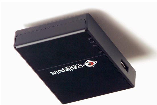
Cradlepoint CTR-350 Cellular Travel Router