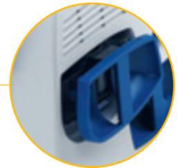
Choose one or two laminators with quick-change cartridges