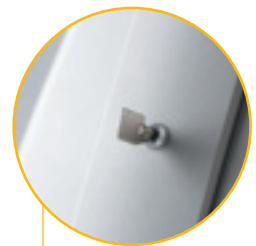
Secure storage of rejected cards