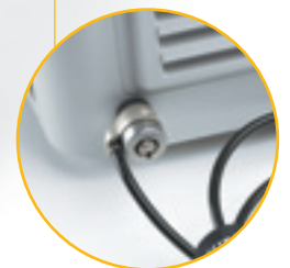
Kensington® lock secures the printer