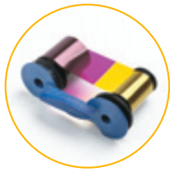
Quick-change ribbons switch out in seconds

The Datacard® SP75 card printer delivers a powerful and unprecedented combination of advanced security and extreme reliability. It is designed to protect critical assets and enhance security in government and corporate environments. Plus, it provides the high-quality output and fast, dependable operation that colleges, universities and other cost-conscious organizations demand from a desktop card printer.