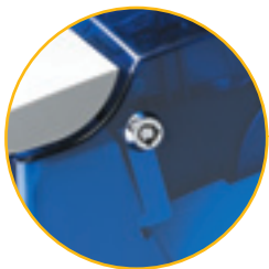
Lock secures ribbons and laminates