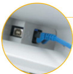
Standard Ethernet port for simple connectivity