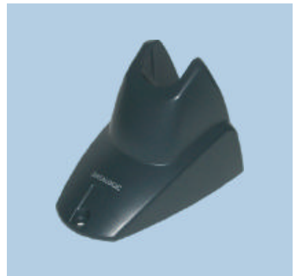
STD Heron™ Hands-Free Stand with optional metal plate