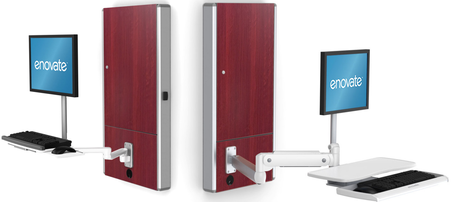
e128 Wallstation, Push-Button Sit-to-Stand Ergonomics

Flexible positioning enables the caregiver to have a full range of motion while maintaining visual contact with their patient. Keeping frequent position changes in mind, the keyboard, monitor, and work surfaces can move together to give the clinician a consistent viewing angle throughout their day.