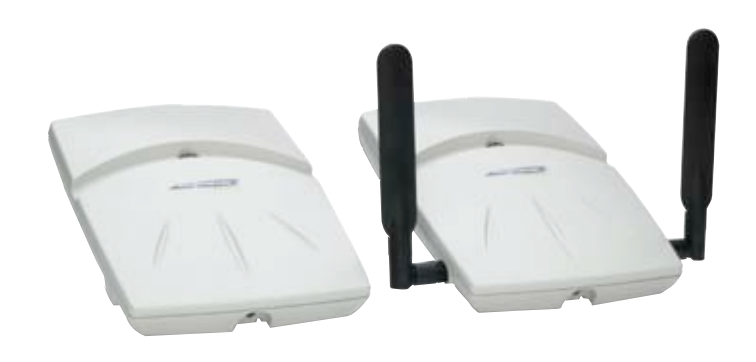
Altitude 350-2 integrated and detachable dual-radio access points provide secure, high-performance wireless coverage for demanding enterprise applications.