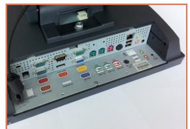
Extensive I/O ports