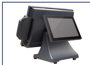
10.1 inch 16:9 LCD customer display