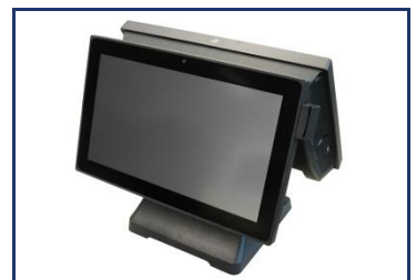
14.1 inch 16:9 LCD customer display