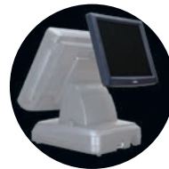
Secondary Rear Monitor