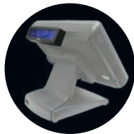
Rear Mount Display