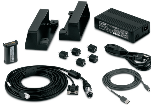
RD5000 Mobile RFID Reader accessories

maximizes your return on investment. An exceptional investment, the device can be easily moved and temporarily mounted from one application to the next — from skate wheel conveyor receiving to pallet jack storage to mobile cart inventory — providing the flexibility to meet multiple and temporary RFID needs throughout the enterprise. Your expanded view of operations enables tighter management control. Present staff can accomplish more throughout the workday, better controlling labor costs. Improved inventory visibility enables a reduction in stocking inventory, as well as in the associated costs and space requirements. And the rugged design ensures maximum uptime — and a low total cost of ownership.