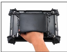
Hand strap (included)