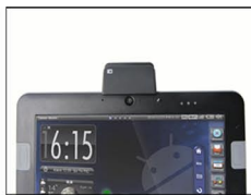
Magnetic stripe reader