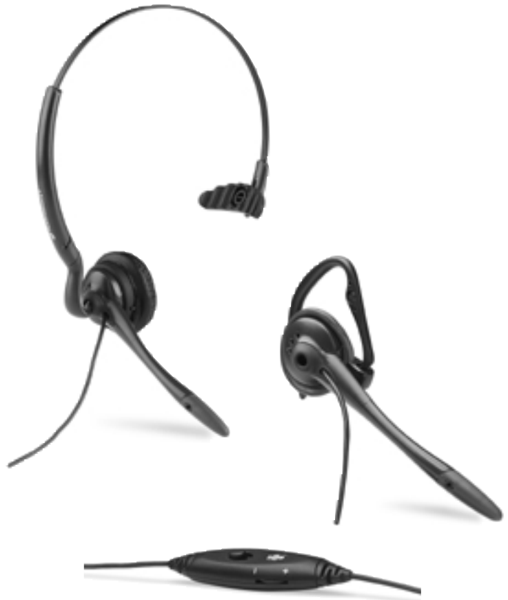
Easy volume and mute control (available on M175)