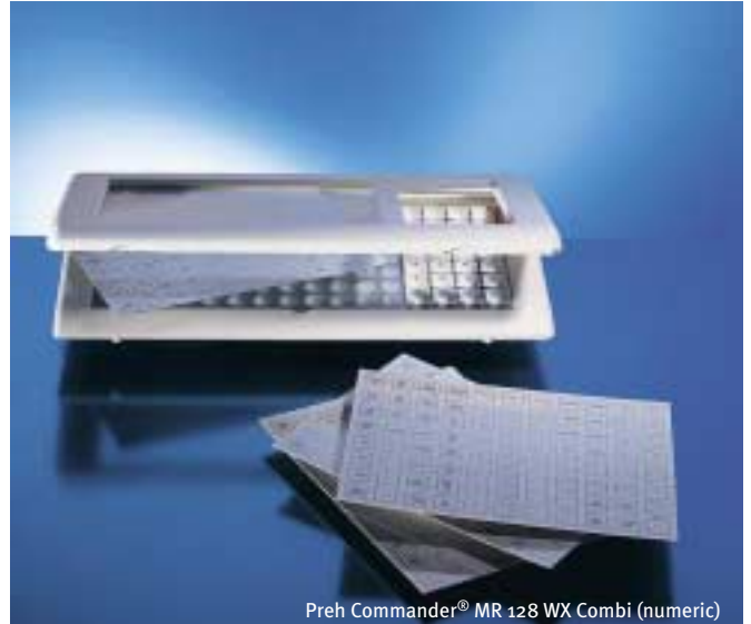
Preh Commander® MR 128 WX Combi (numeric)

Modular data entry system with IP-protected menu sheet technology