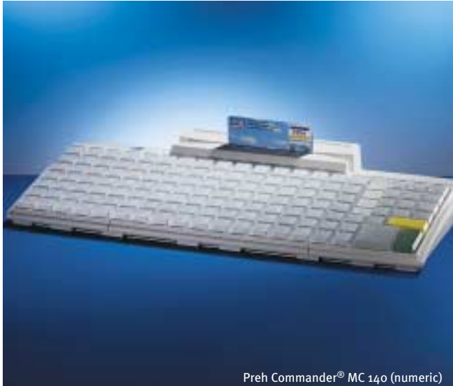
Preh Commander® MC 140 (numeric)

High quality and compact MF2 keyboard with integrated MSR