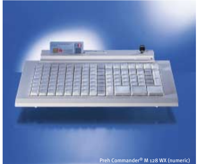
Preh Commander® M 128 WX (numeric)

Modular data entry system offering unlimited flexibility for open design systems