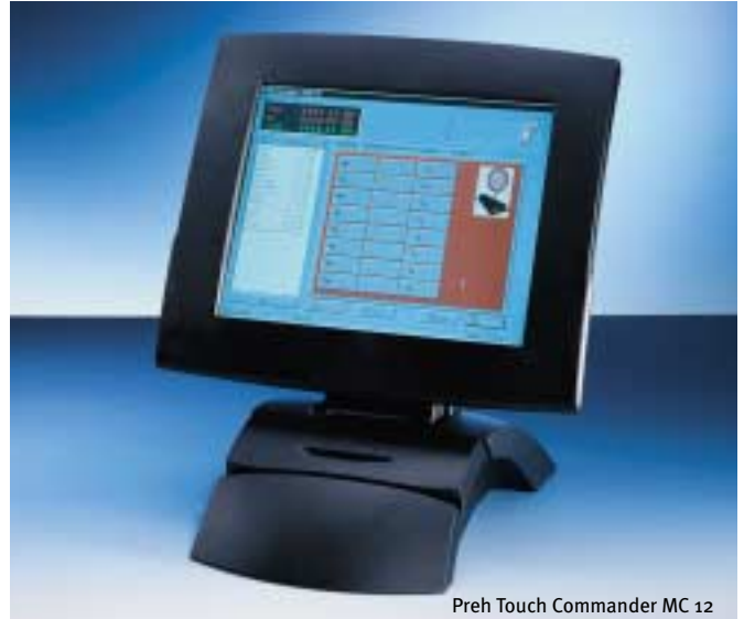
Preh Touch Commander MC 12