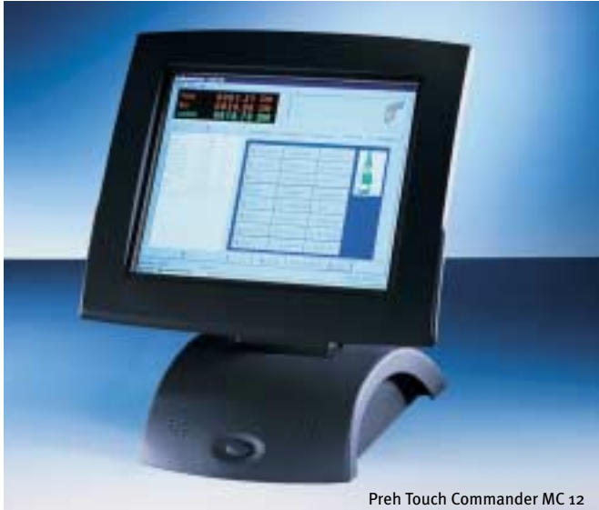
Preh Touch Commander MC 12

Touchscreen with integrated power supply and loud speakers