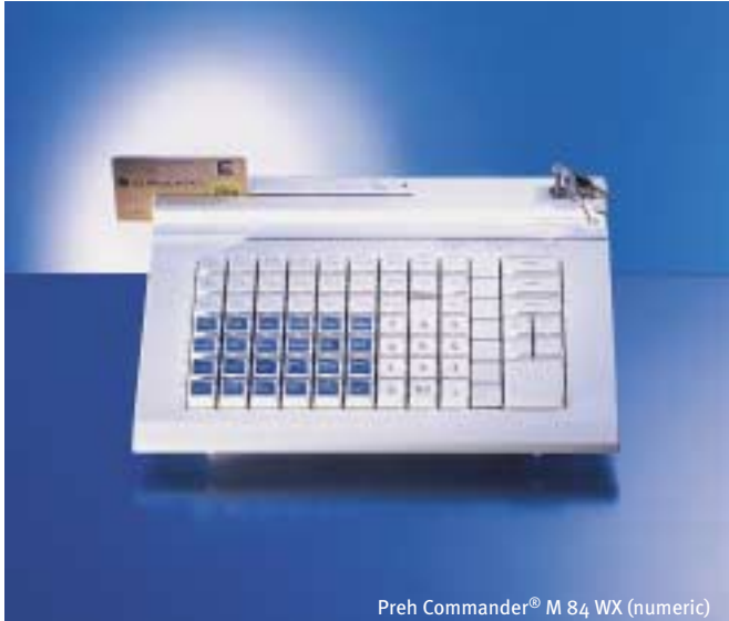
Preh Commander® M 84 WX (numeric)

Modular data entry system offering unlimited flexibility for open design systems