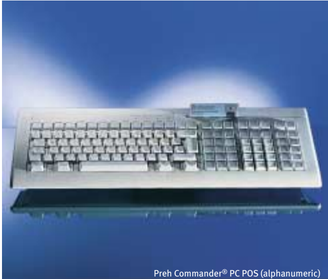
Preh Commander® PC POS (alphanumeric)

Freely programmable MF-keyboard with additional keypad