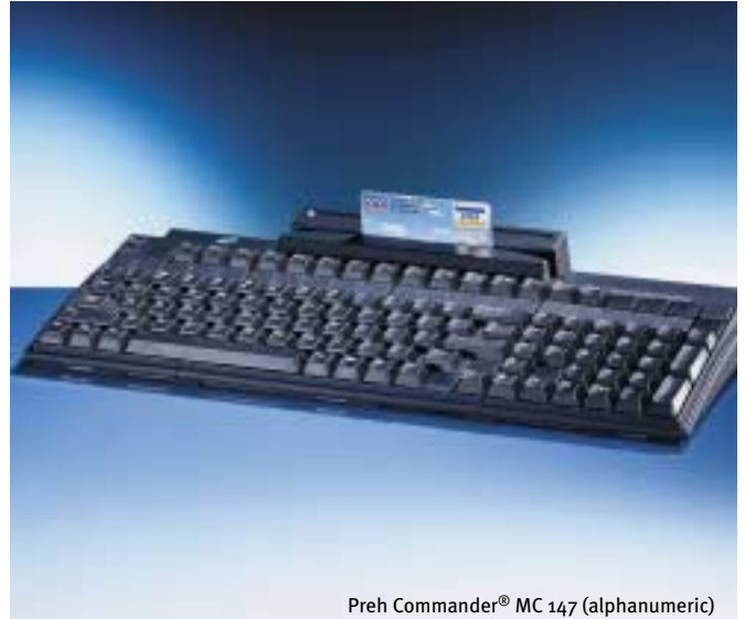
Preh Commander® MC 147 (alphanumeric)

High quality and compact MF2 keyboard with integrated MSR