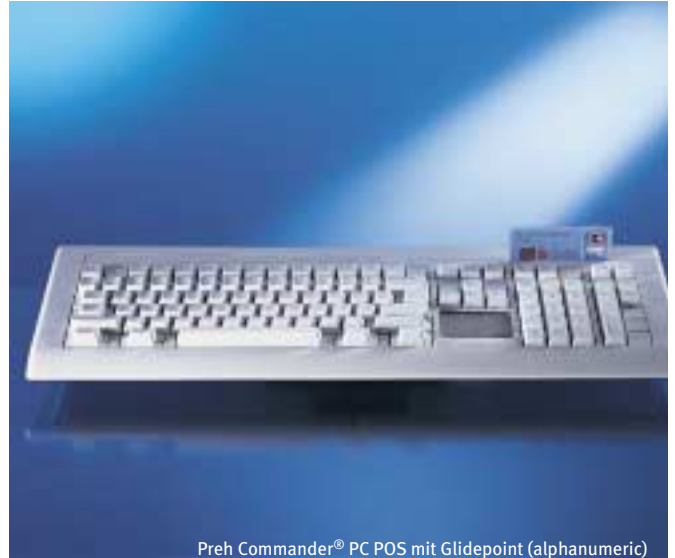
Preh Commander® PC POS mit Glidepoint (alphanumeric)

Programmable MF-keyboard with additional keypads and glidepoint