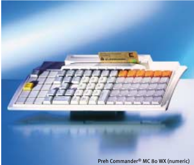
Preh Commander® MC 80 WX (numeric)