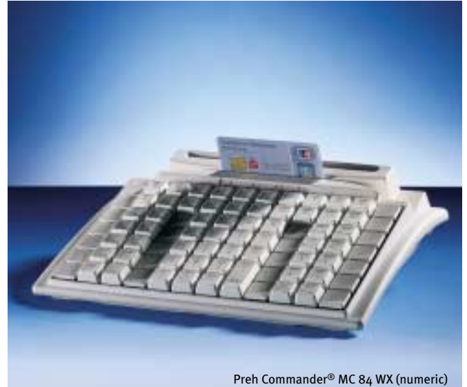
Preh Commander® MC 84 WX (numeric)