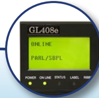
Large LCD Display Panel