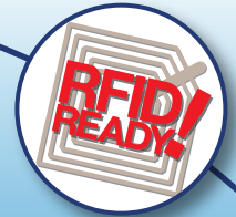
RFID Designed Printer