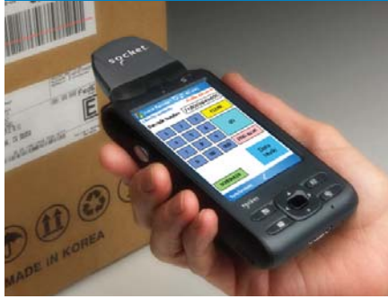
SoMo 650 with optional CF Scan Card barcode scanner (sold separately)