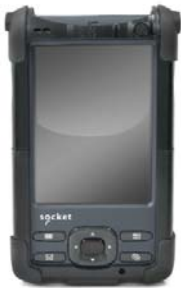
SoMo 650 with optional DuraCase protective case (sold separately)