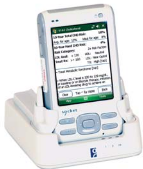
SoMo 650Rx in optional charging cradle