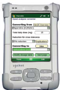
SoMo 650Rx with optional DuraCase protective case (sold separately)

“The SoMo 650 provides the features and the flexibility that is needed in healthcare and does it in a package that can be supported at an enterprise level.”