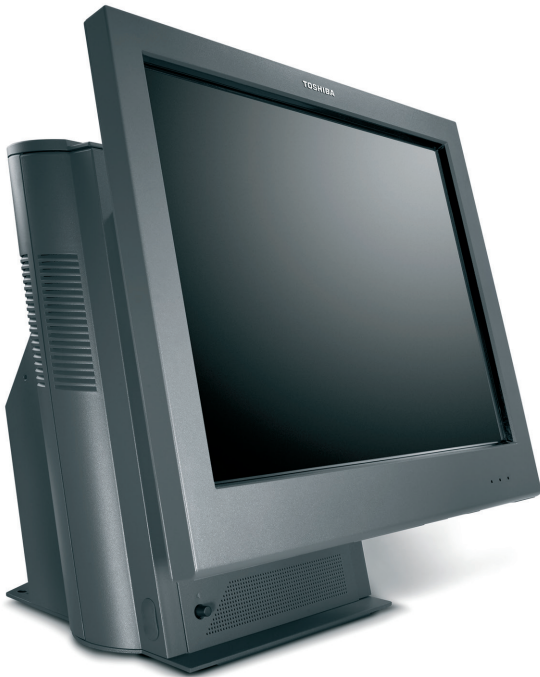
Shown: Toshiba SurePOS 500 Model 570