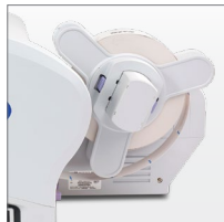
Large Media Supply