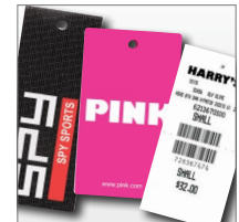
Great for Retail Tagging