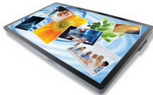
Multi-Touch Chassis Displays

3M combines its industry-leading multi-touch technology that delivers an ultra-fast, accurate, and precise multi-touch response, with a high-definition, wide viewing angle LCD, to create a multi-touch chassis for your next generation interactive application. The rugged all steel frame and a highly durable glass front surface provide the durability needed for demanding public use environment.