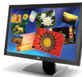
Multi-Touch Desktop Displays

3M™ takes interactive display technology to the next level by combining uncompromising multi-touch performance, brilliant high-definition graphics, wide viewing angles and elegant product design into a fully-integrated, easy-to-use, plug-and-play multi-touch desktop device.