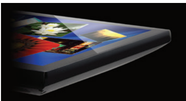
Flat Front Surface (Virtual Bezel)