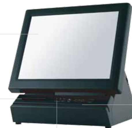
System and printer status LEDs, power switch, brightness control buttons